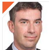
Dragoș Tudorache MEP, Chair of the Special Committee on Artificial Intelligence in the Digital Age (AIDA), European Parliament